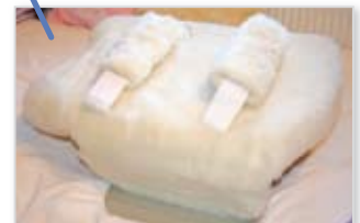
Side Lying Table

Available in different sizes and adjustable in both height and angle the side lying leg support solves a complex problem with minimum fuss. For more active users, the top of the support is slotted so that soft straps can be added to the system to help guide the position of the leg.