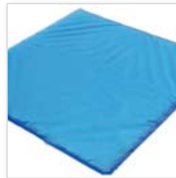
EZ Feel Gel Cushion

The EZ Feel cushion is made of high quality polyurethane gel. The surface is solid, smooth, and dissipates heat which helps to regulate the users body temperature. The gel also provides excellent pressure distribution and comfort. The true gel material will not migrate, leak, evaporate, harden, or dry out if the cushion is accidentally punctured. The material is highly resistant to bacteria and bodily fluids and can be easily cleaned with warm soapy water or a disinfectant.