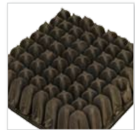
DebbonAir Air Cushion

15-18 Maxwell Road Woodston Industrial Estate Peterborough Cambridgeshire PE2 7HU