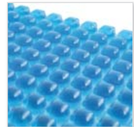
EZ Feel Gel Cushion Ultra