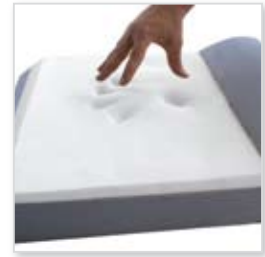
Slow Release Foam Seat

is a polymer which is both temperature sensitive and energy absorbing, it responds to body heat and forms to the body's shape. The supporting layer improves support and flexibility for the upper layer